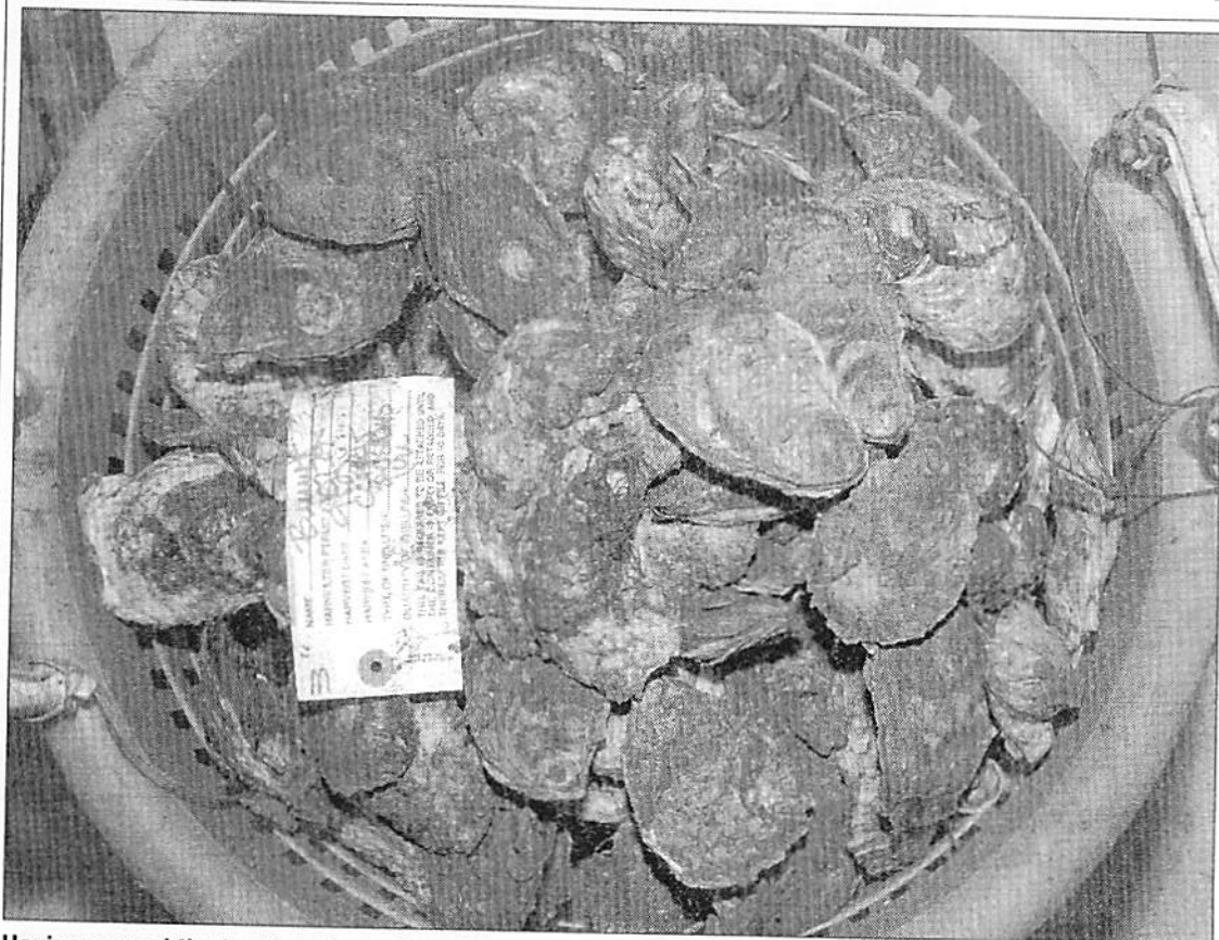
Having passed the test for size and quality, these specimens are ready to be shipped out to area restaurants as Island Creek Oysters.

A Duxbury oyster farmer who "plants" 500,000 seeds on his lease is fortunate if, two years later, he harvests 200,000 adult oysters. The retail price of an oyster in 2001 worked out to 75 cents a piece, said Moles,